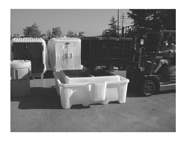
4) Load the IBC tote onto the pedestal of the spill pallet from the side.