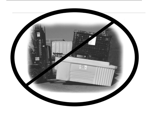
Never move the spill pallet when loaded.