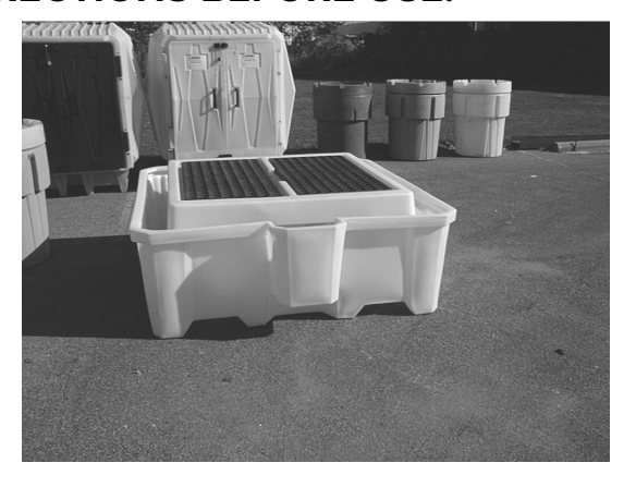
2) It is recommended to have the dispensing bucket area facing forward.