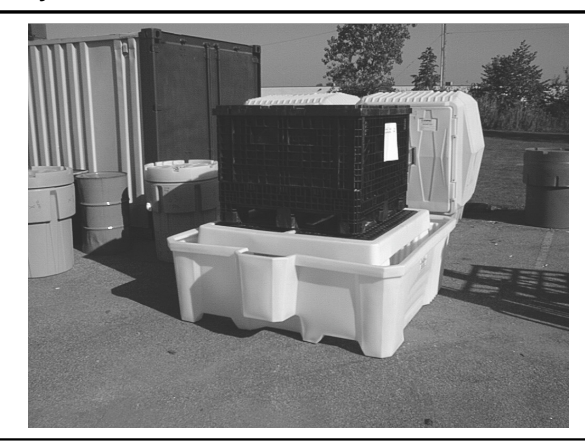
5) The maximum load is 3,000 lbs. (1,360 kg.) The load must be centered on the pedestal.