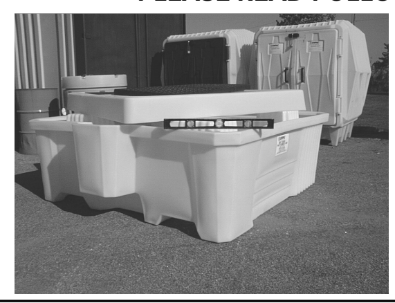
1) The IBC spill pallet must be placed on a solid, level surface capable of handling 3,000 lbs. (1,360 kg.)